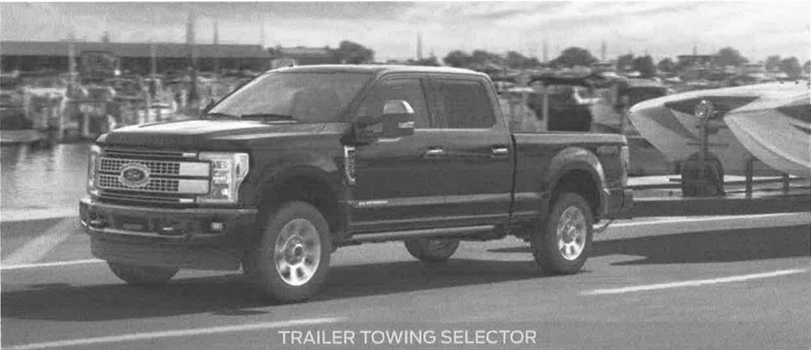
TRAILER TOWING SELECTOR